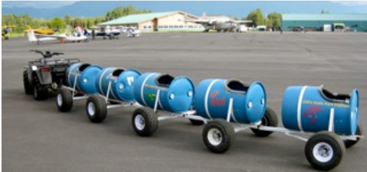
Youngsters got to ride Ciff's Kettle Korn Express at the Palmer Air Fair.