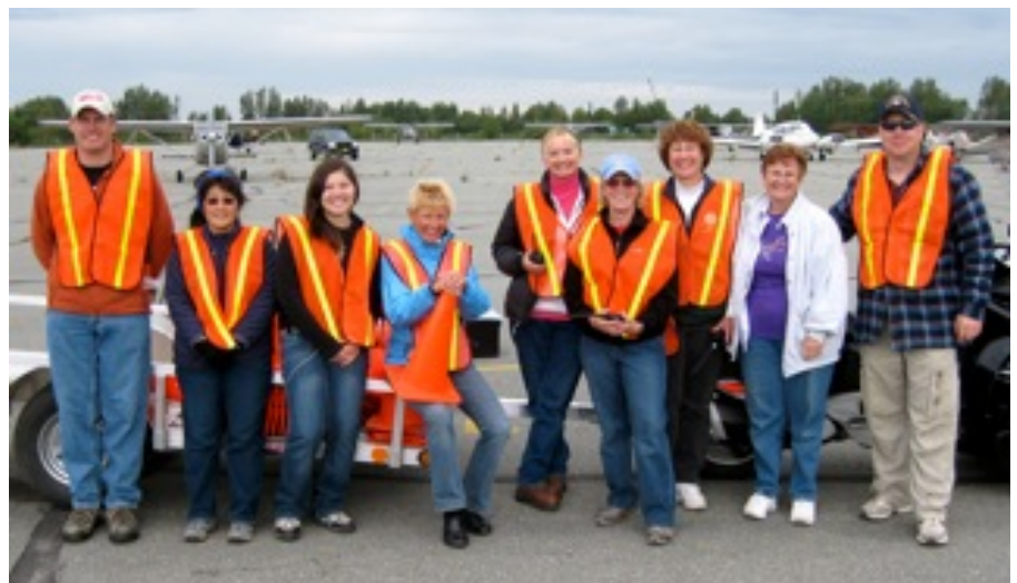
Volunteers at the Short Field Skills Assessment on July 24.